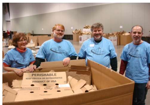
Volunteers from First Baptist Church working hard in the food line.