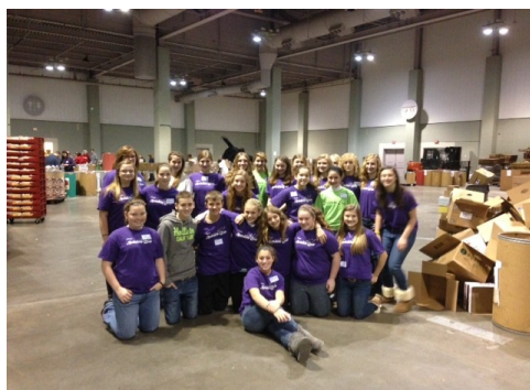
Volunteers from the North Syracuse Builders Club pose after a day of hard work

We would like to thank all of the Bell Ringers that helped us Make Change Happen in 2012. Without you we would not be able to serve over 41,000 people here in Onondaga County.